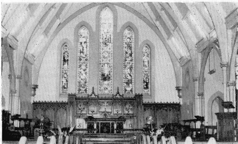
THE "NEW" ALL SAINTS'