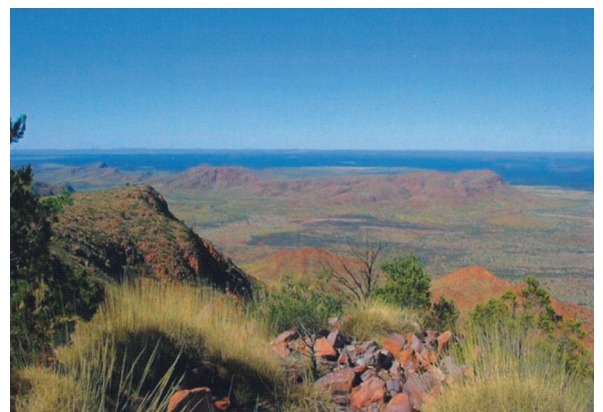
View of Anmatyerr lands from Mount Leichhardt, photo by David Strickland

"Altjerr kwenh tjerttj ahelh-areny mapeh nyerrkek, lakenheng rang lerekw kwerenh nyent renh ahelh-warn lanthek. Kwereng tjerttj inarl ler kwerenh nakemeng, inang Altjerrel-ayel kwet iteth anetjenh."