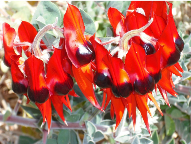
Sturt Desert Pea in flower in Central Australia (pictured above)