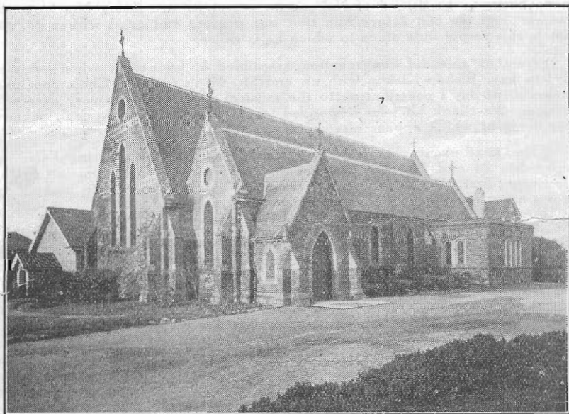
All Saints', Petersham

IT'S YOUR CHURCH—WORK for it, PRAY for it, PAY for it.