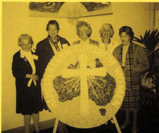
August 1987. A.C.W. National Conference, ADELAIDE.