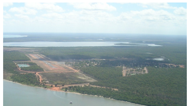
Aerial view of Aurukun (west coast of Cape York Peninsula, North Queensland)

"Puth nil God.an kan-kanam kaangk wunan ngampar pam wanchant, an ngangk pal pekkuwam kaangk wunan ngampar, ke'-paal nilan nhengk nungantam kaa'-thonaman kuch nunang, than yipam wee'- wee'anangan ngangk punch-aakamaniy thee'ayn nungant-a, an than ngangk aak umpuyaman wun-wunayn nungantang, God.antang, nil ke' kuchiy thanang nungantam anpalan."