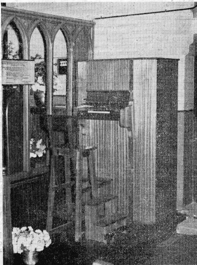
ALL SAINTS' ELECTRONIC CARILLON