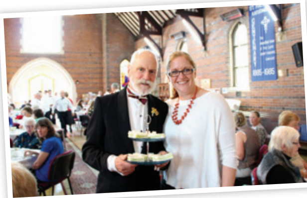
High Tea at Upper Blue Mountains with Special Guest Kate Bracks, winner MasterChef 2011.