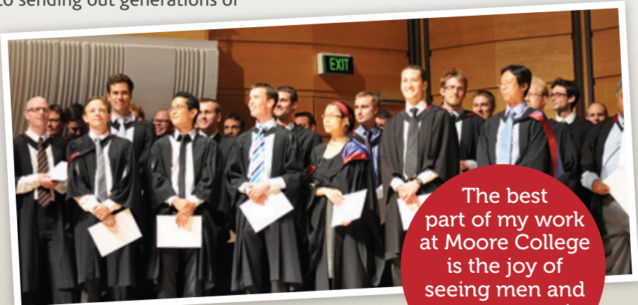
BD Graduates 2013

Just do it! Every Christian is a minister and missionary whether it is at the school drop-off or around the office water cooler. Moore College has a wide range of course choices that can help you mature in ministry and give you greater confidence in mission no matter where you are.