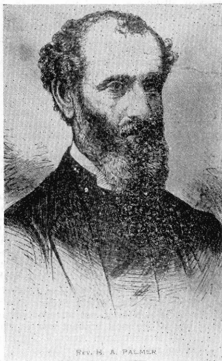
First Rector of All Saints 1869-1879