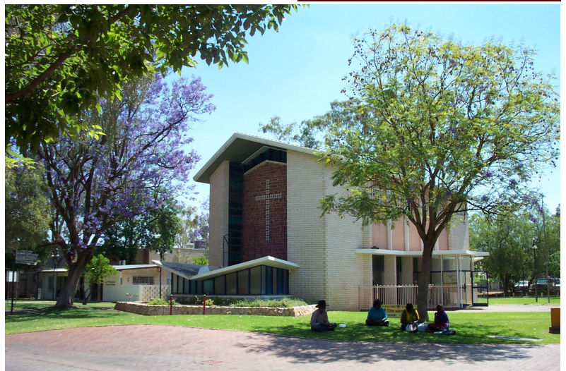
Left: Uniting Church in Alice Springs

There are currently no Audio-Visual Resources available for this specific language.