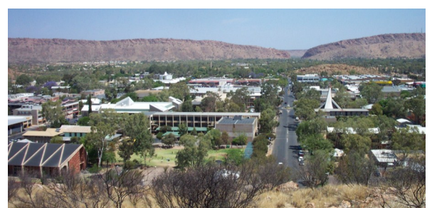
Above: Alice Springs

Anwernenhe akaltyele-anthaye Ngenhenhe utyernemele tnaketyeke arratye anthurre. Anwerne Ngenhe apayuthneme Unte apetyetyeke anwerneke-werne Unte anwerneke akngerre anthurre anetyeke arne ingkirrekeke-arlke re."