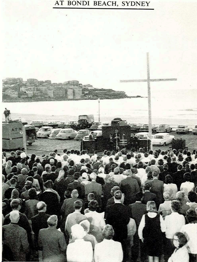
This is a sermon delivered at the SUNRISE EASTER SERVICE on Bondi Beach, Sydney, Australia, on Sunday, 18th April, 1965.