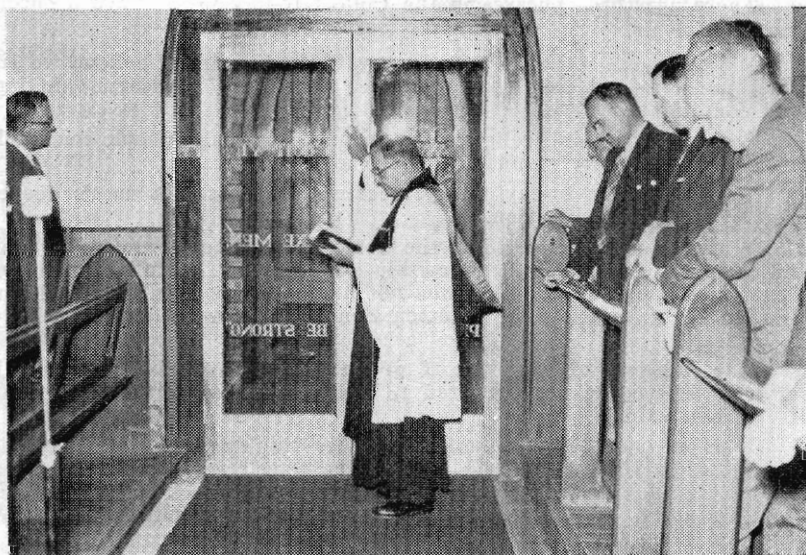
DEDICATION OF Y.C.I. DOORS, 11th NOVEMBER, 1960