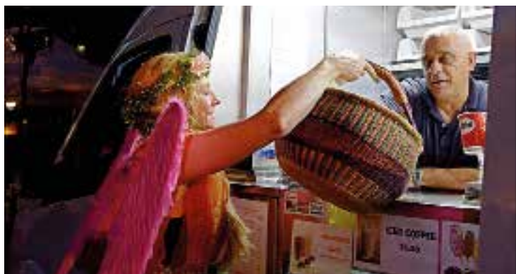
An "angel" at last year's market spreads goodwill.

THE ST JOHN'S CHRISTMAS market will run again this year in Darlinghurst on December 11.