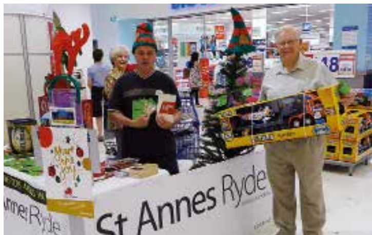
Community generosity: St Anne's collecting toys for Anglicare.

The store, like many similar programs, allows buyers to purchase gifts for people overseas that will