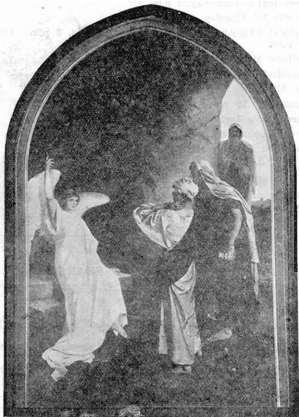
The Morning of the Resurrection.