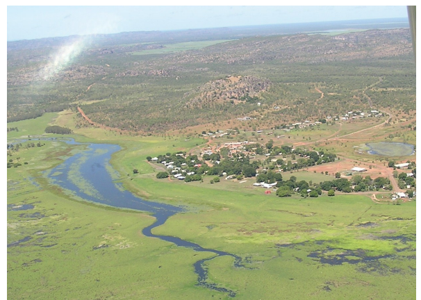
Aerial view of Oenpelli

"Wanjh Jesus biyawoyhmarneyimeng Nicodemus, bu yawoyhmulewarreni, wanjh yimeng, "God nawu benmarnedjareminj bininj birriwarlahkenh rowk wanjh kunmekbekenh kunu benwong bedberre nawu nuye beywurd nadjalkudji, ba bu bininj nawu kabirrihwoybukwon, wanjh minj mak kabirrimalngdownen dja kabirridjalmaIngmimbi munguyhmunguyh."