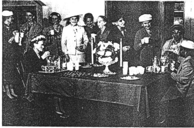
Presbyterian women who sponsored "goodwill Team" in 1956.