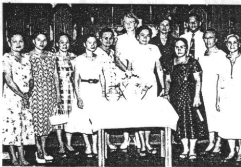
First FLC offering brought by Philippine women.

Asian Church Women's Conference (ACWC), was part of East Asia Christian Conference at that time. ACWC members accepted to take part in FLC and invited women from different parts of the world to join them. ACWC at their second conference agreed to be the stewards of the Fellowship of the Least Coin, interpreting and promoting the idea for FLC; while the East Asia Christian Conference (now Christian Conference of Asia) administered the funds. The first offerings were given by Filipino women in 1957.