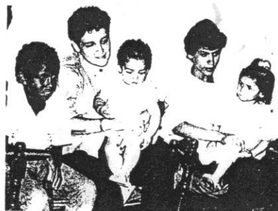
Abandoned Brazilian mothers and their children, living temporarily at Casa da Mamee, in Sao Paulo, a temporary refuge for these women and their children. Seed funding by Fellowship of the Least Coin. (1989)