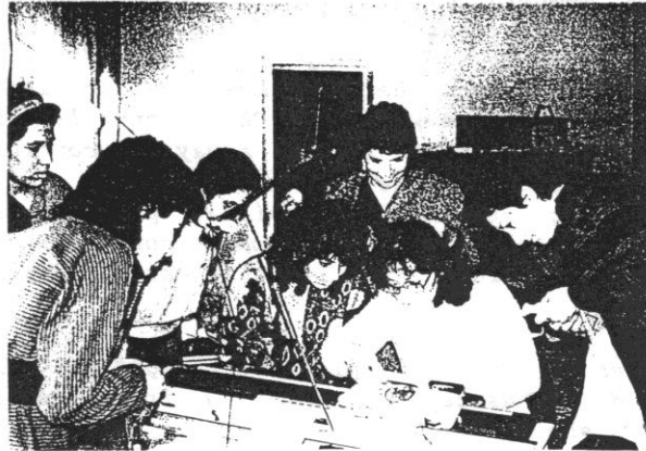
Women's sewing and knitting project Yazdich, Syria. (1990)