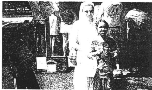
"Women's Refuge and Training Centre" - Popondetta Papua New Guinea