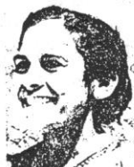
The Founder of FLC

ICFLC continues publishing 'Circle of Prayer' every alternate year. Vol.13 is being printed by the women from All Africa Conference of Churches, Nairobi, Kenya. The theme for vol.13 is 'PARTNERSHIP IN A CHANGING WORLD'. It will be soon ready for use. Theme for vol.14 will be 'CHRIST: OUR VISION AND HOPE'. The process for writing articles for vol.14 has been started.