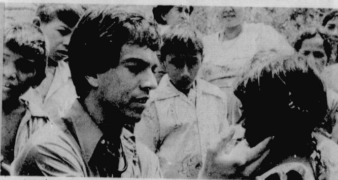
A World Vision doctor inspecting a refugee child in the refugee camp on the El Salvador/Honduras camp.

A major refugee crisis has developed in El Salvador. People are fleeing from rural areas into makeshift camps in San Salvador. It is estimated that there are more than 120,000 displaced people in El Salvador.