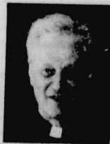
RICHARD WURMBRAND (Founder) 14 years in Communist prisons

Christian Mission to the Communist World Ltd. THE VOICE OF THE MARTYRS P.O. Box 598, Penrith, N.S.W. 2750 (047) 218221