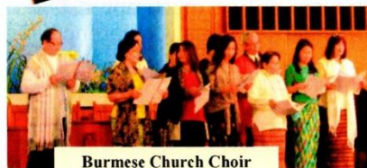
Burmese Church Choir