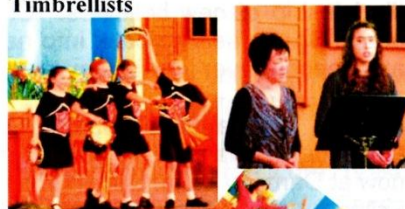
Chinese Contemporary Gospel Dance