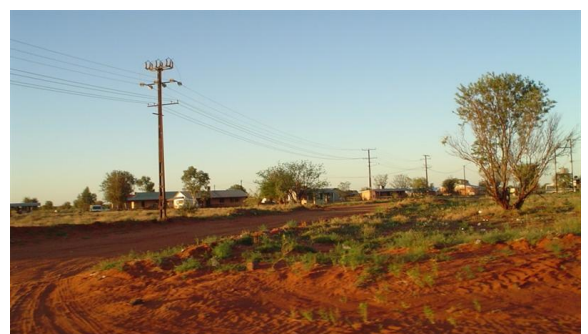
Community of Papunya

Try a Pintupi/Luritja Language Puzzle at www.lca.org.au/resources/frm/pintupipuzzle.pdf http://www.ourlanguages.net.au/