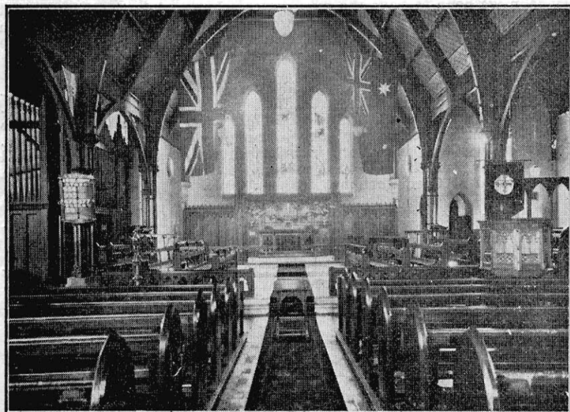
INTERIOR OF ALL SAINTS' CHURCH