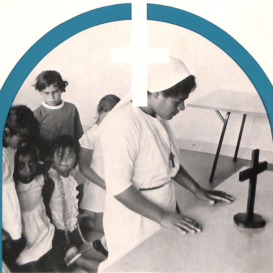
Worship at St. Christopher's Home, Naulu, Fiji.