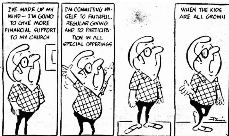
Copyright H. Paris Clip Art Panel Cartoons for Churches, Baker 1984. Used by permission.