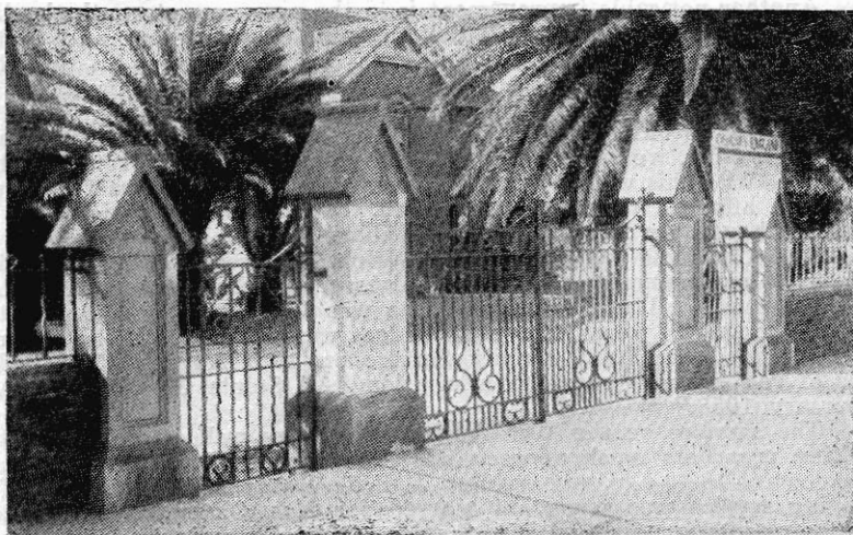
WIPPELL MEMORIAL GATES