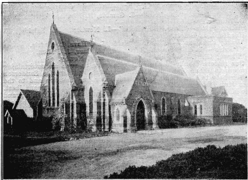
ALL SAINTS' CHURCH 1870-1958