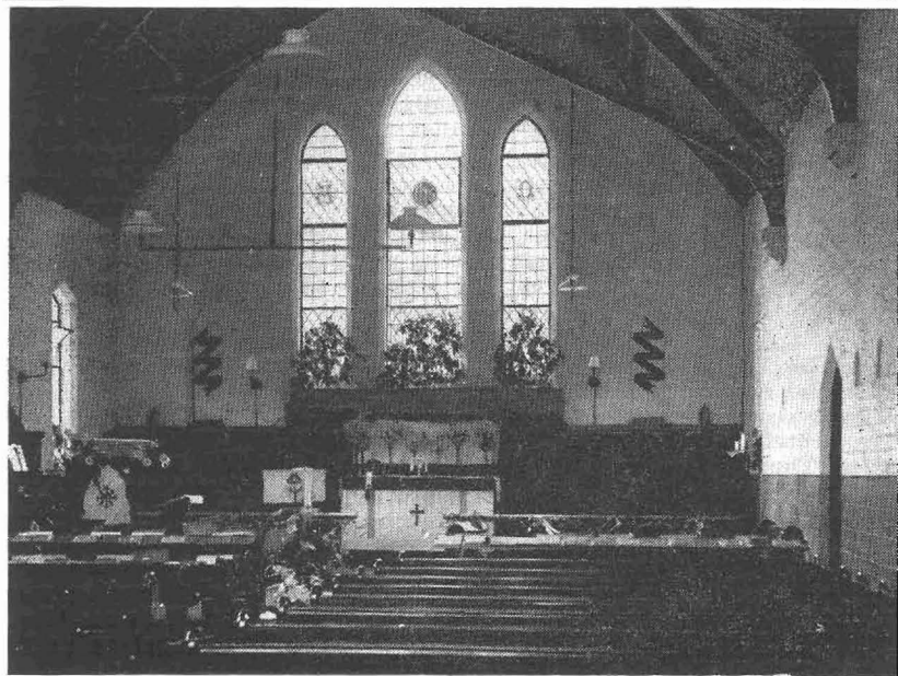
"THE CRYSTAL STREET MISSION CHURCH"