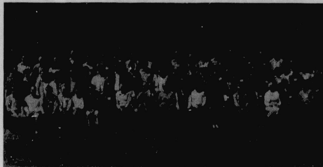
Church Growth participants at Bible College of South Australia.

Approximately sixty pastors and church leaders gathered together on the campus of the Bible College of South Australia to participate in the Church Growth seminar. Participants came from every state in Australia and as far away as New Zealand. There were no less than seven separate denominational bodies represented.