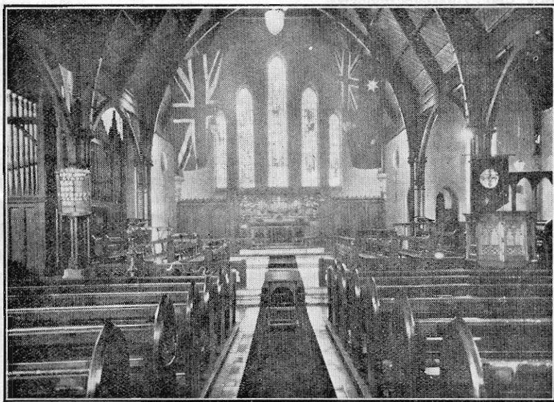
The East End: All Saints', Petersham.