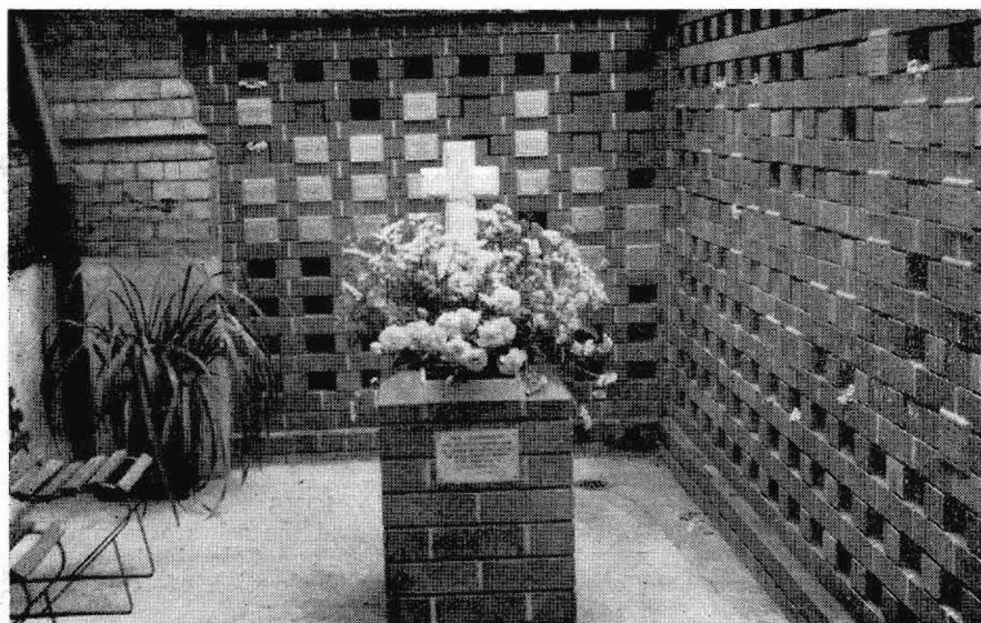
ALL SAINTS' COLUMBARIUM