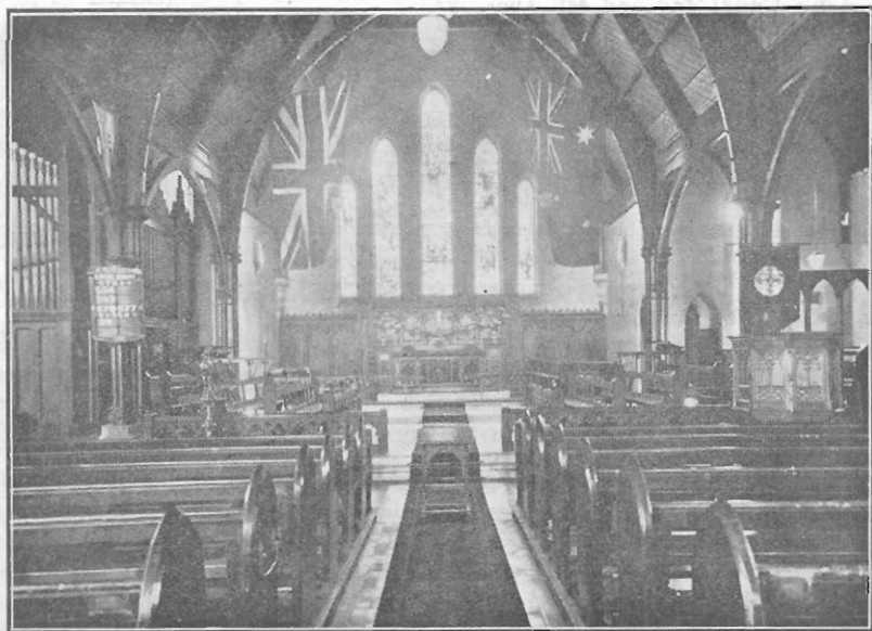
The East End: All Saints, Petersham.