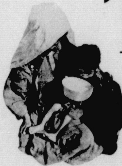
Away in a Manger, mother says "little Friday Flower become alive again"

Away in a manger no crib for a bed the babies are crying the cattle are dead