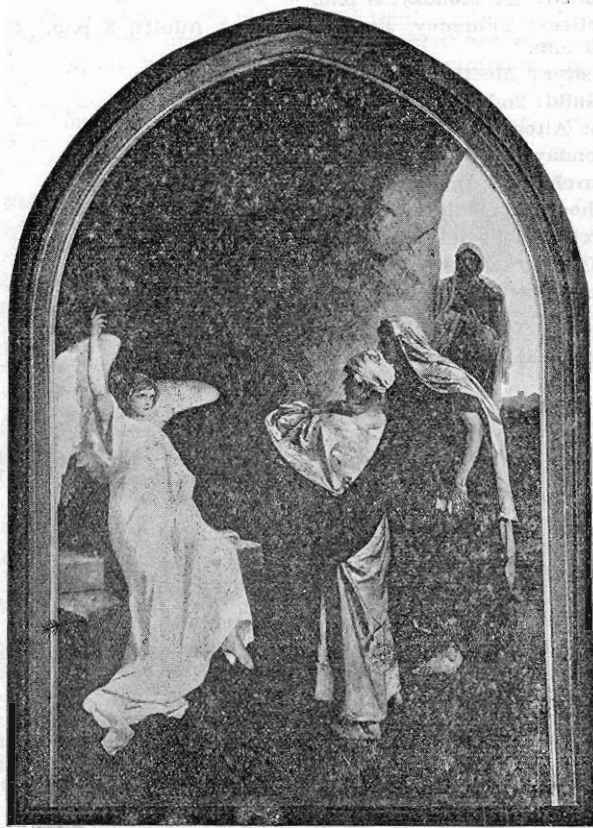
The Morning of the Resurrection.