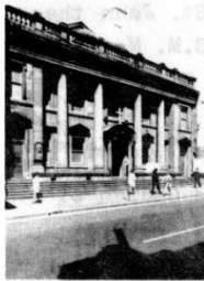
Pitt St. Congregational Church 264 Pitt St., near Park St.