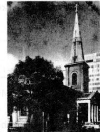
St. James' Anglican Church King Street, Macquarie St. end.

Place St. James Anglican Church 173 King St. Sydney.