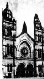
The Great Synagogue (Jewish) Elizabeth Street, near Park St.

The final place of interest on this tour will be a conducted lecture of the Great Synagogue.