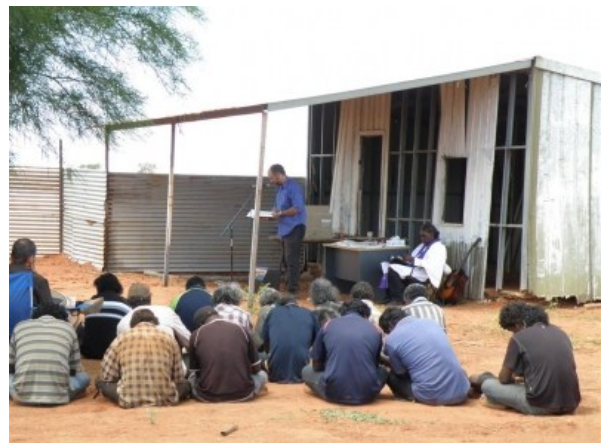
Above: The Alyawarr Bible Dedication Palm Sunday 2010

Irrultja School Website www.schools.nt.edu.au