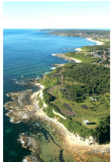
Pictured right: part of Lake Macquarie's 174Kms of foreshore