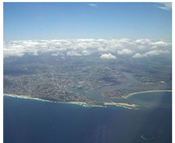
Aerial photograph of Newcastle

Wara—four or five (also the word for the palm of the hand)