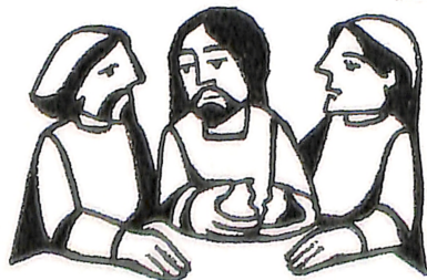
They knew him in the breaking of the bread