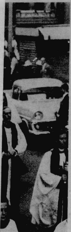
annual Sydney Good Friday draws Cathedral.

Sydney, for transmission by post newspaper.