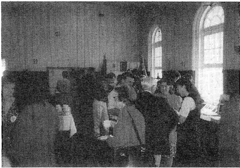
The 125th Anniversary Celebration Luncheon November 1995