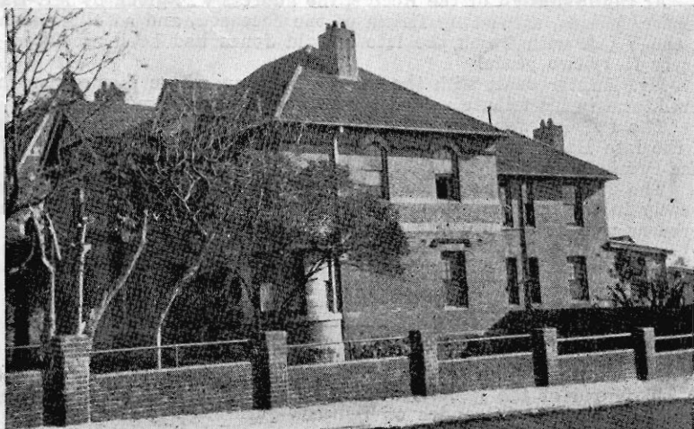
ALL SAINTS' RECTORY BEFORE REPAINTING