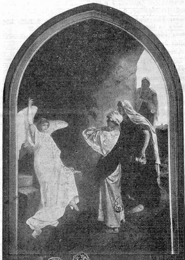
The Morning of the Resurrection.