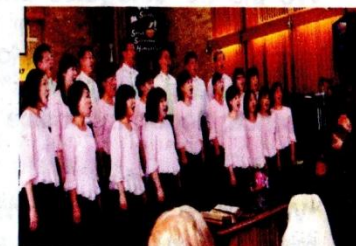
The Shine Chorus-A Korean Choir, thrill the congregation with their excellent rendition of classical sacred music