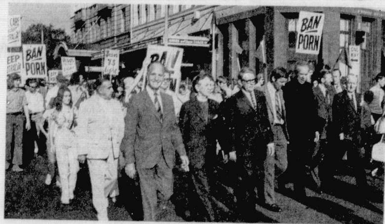
The front ranks of the F.O.L. March through Sydney's streets.