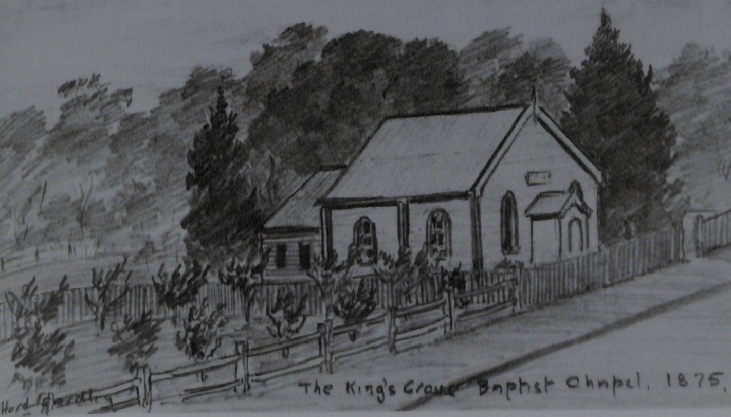
The King's Grove Baptist Chapel, 1875.