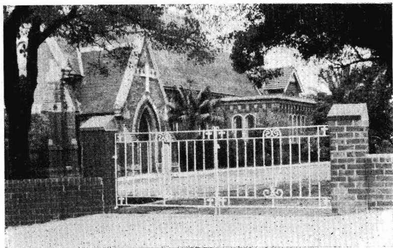
"ALL SAINTS' MEMORIAL GATES