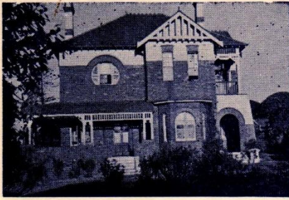
WYBALENA, 1 Appian Way, Burwood. UJ 5114

20 Chalmers St. Willoughby. Thurs 22. 1957.